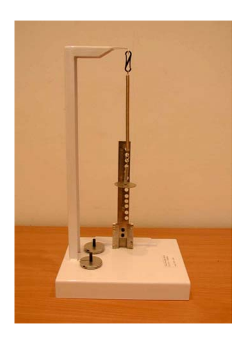
Fig.6 Elastic pendulum

The exhibition is open three days and it is visited by all the students and teachers of the school.