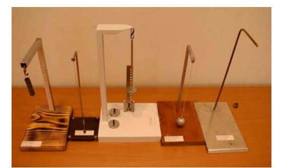
Fig.5 Gravitational and elastic pendulums

In the first course of high school they study mechanics. Only one project was developed with these students. They manufactured experimental devices for determination of the elastic coefficient of a spring. These elastic pendulums are shown in Fig.6. They measured the elastic forces, the deformations and they calculated the elastic coefficient of the spring.