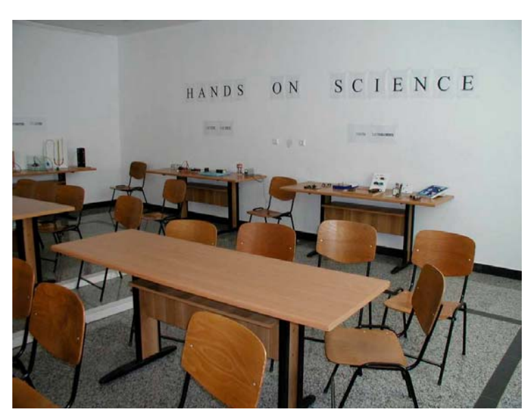
Fig.7 Exhibition with experimental devices manufactured by students