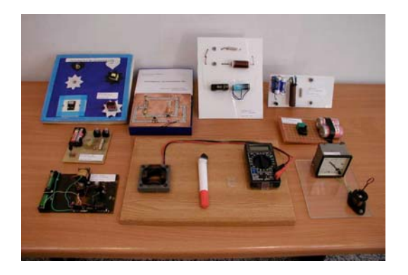
Fig.2 Devices to reveal the induction phenomenon

A real competition appeared between the teams of students for the smartest device and the best presentation. Each device was analyzed and discussed in the class. The other students not involved in that particular project have made very interesting comments. As a matter of fact they evaluated the project and graded them.