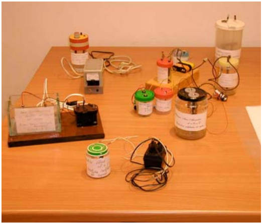
Fig.1 Voltammeters manufactured by students