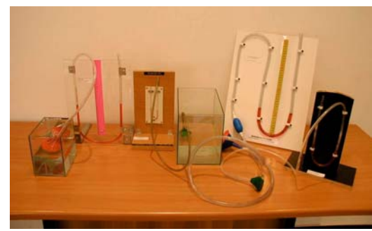
Fig.4 Liquid manometers

Fluid mechanics and the mechanical oscillations are studied in the third course of high school. Two projects have been developed with the students of this class. The objectives of these projects were: