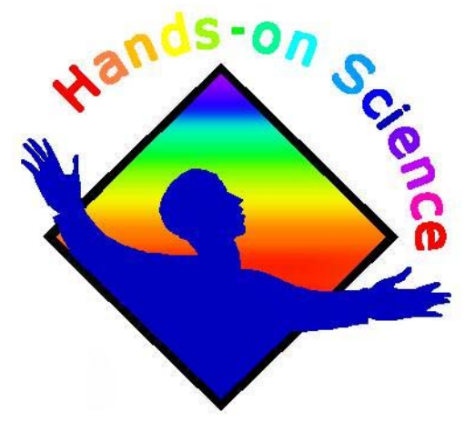
Figure 2. The "Ideas for Science Fairs" European contest is expected to involve many hundred students all over Europe.

In January 2004 we launched the 1<sup>st</sup> European Contest on "Ideas for Science Fairs" with which we hope to induce the generalisation of the organisation of Science fairs in the Schools.